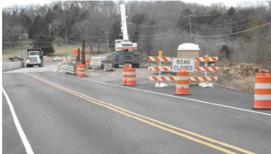
Construction continues on Concord Road

CONCORD ROAD EAST PROJECT – PHASE II. These improvements will address substandard road conditions on this State highway from Sunset Road to Nolensville Road. Improvements will be similar to the recently completed work from Edmondson Pike to Sunset Road. Construction began in late calendar year 2013 and is expected to be complete by May 2016. This project will also extend the 10 foot wide paved bikeway/pedestrian trail from Sunset Rd to Nolensville Rd.