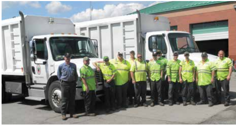
Brentwood Public Works is ranked among the very BEST at snow removal for communities in Middle Tennessee.