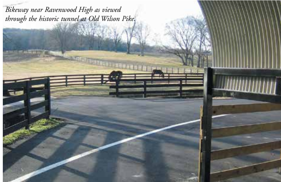
Bikeway near Ravenwood High as viewed through the historic tunnel at Old Wilson Pike.

DID YOU KNOW? The Parks Department was officially started in 1989. At that time the population of Brentwood was 16,392 and the City had 3 parks totaling less than 50 acres. Now in 2015, the City’s population is over 40,000 and the Parks system has grown to 961 acres with 13 parks and numerous greenways. The City now ranks near the top of cities in the State of Tennessee in the amount of dedicated park acreage per 1,000 residents.