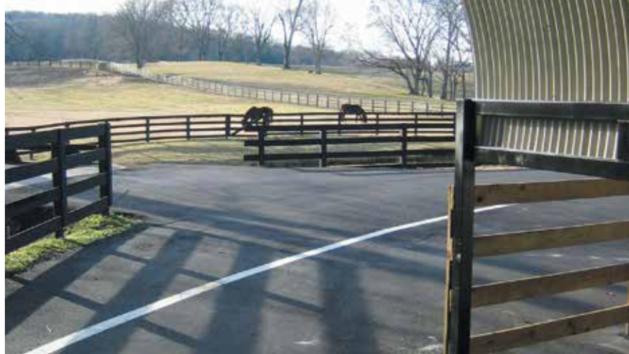
Bikeway near Ravenwood High as viewed through the historic tunnel at Old Wilson Pike.

DID YOU KNOW? The Parks Department was officially started in 1989. At that time the population of Brentwood was 16,392 and the City had 3 parks totaling less than 50 acres. Now in 2015, the City's population is over 40,000 and the Parks system has grown to 961 acres with 13 parks and numerous greenways. The City now ranks near the top of cities in the State of Tennessee in the amount of dedicated park acreage per 1,000 residents.