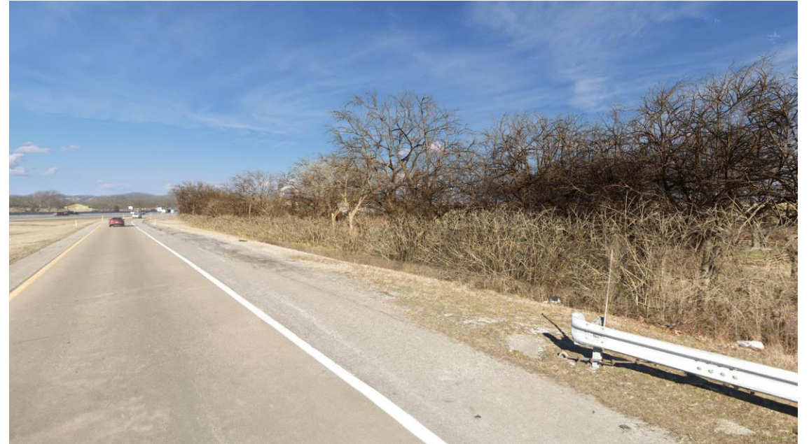
View from I-65 On-Ramp – tank is largely hidden by fence line with trees