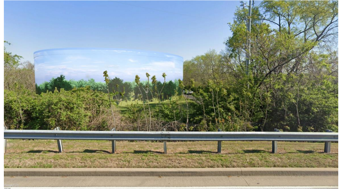
View from Concord Road