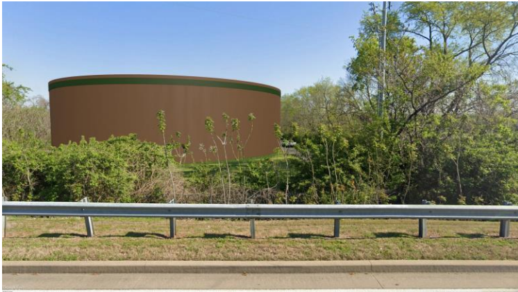
Partially Buried Option – Sidewall 35 ft above grade on Concord Road side