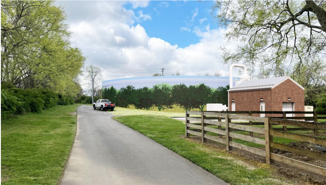
View from Greenway

Partially Buried Option – Sidewall 15 ft above grade on Concord Road Side