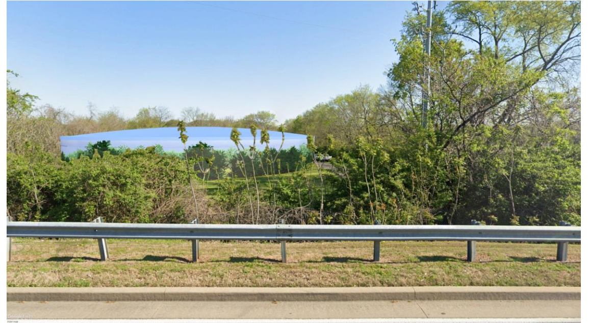
View from Concord Road