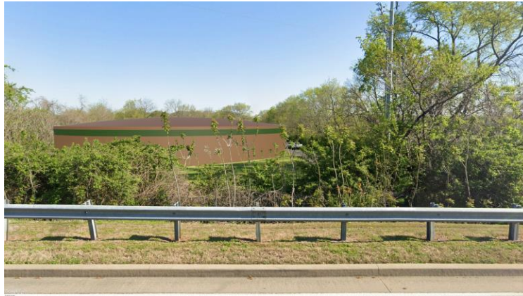
Partially Buried Option – Sidewall 15 ft above grade on Concord Road side