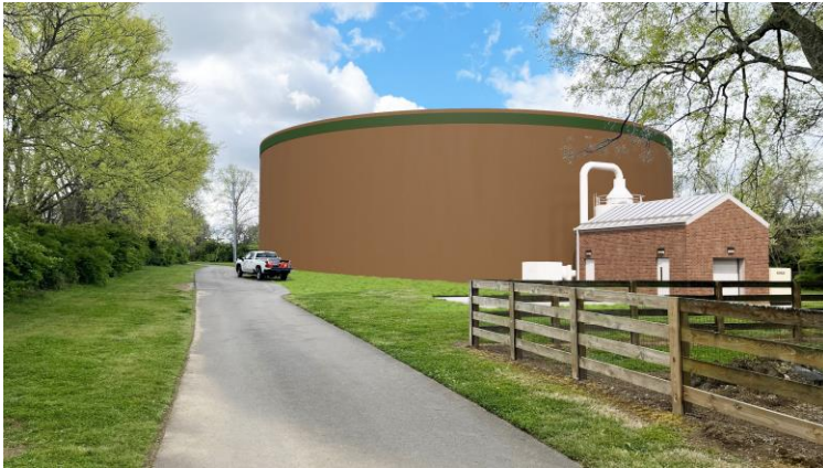
Partially Buried Option – Sidewall 35 ft above grade on Concord Road side