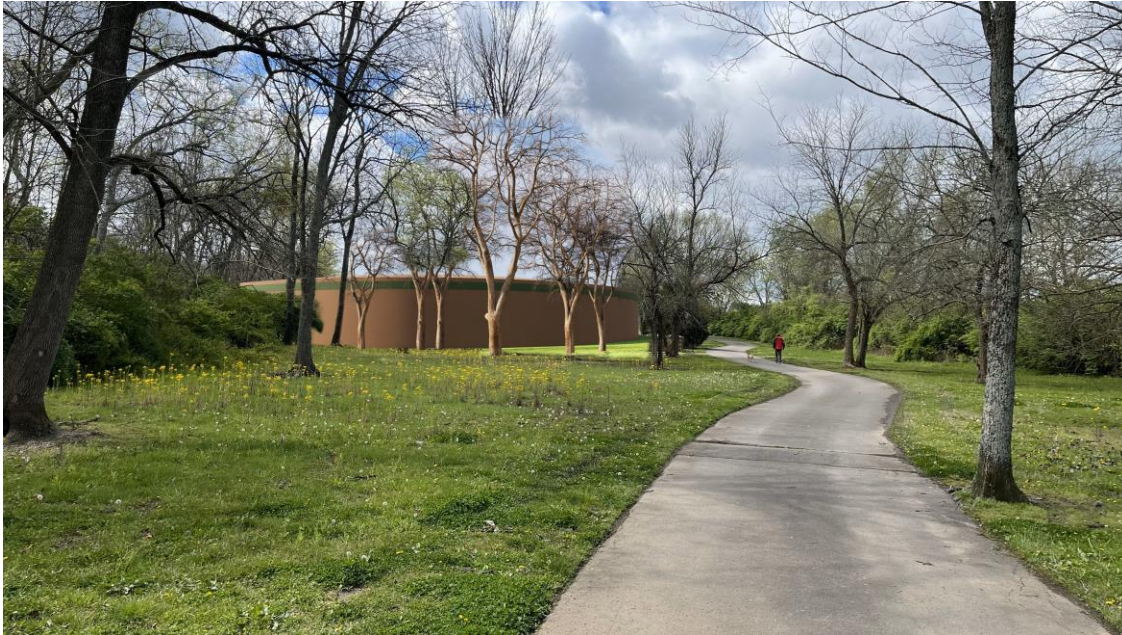
View from Greenway – wetland area and stream crossing sidewalk in foreground

Partially Buried Option – Sidewalk 30 ft above grade