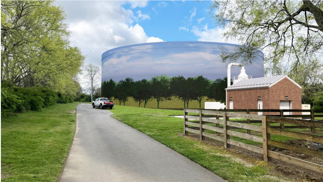
View from Greenway

Partially Buried Option – Sidewall 35 ft above grade on Concord Road Side