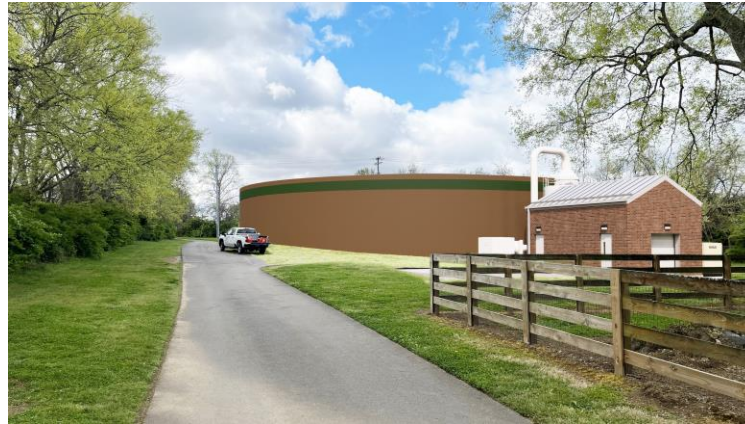
Partially Buried Option – Sidewall 15 ft above grade on Concord Road side