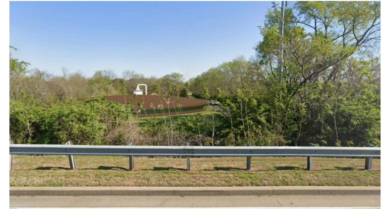
Deeper Bury Option – Sidewall 3 ft above grade on Concord Road side