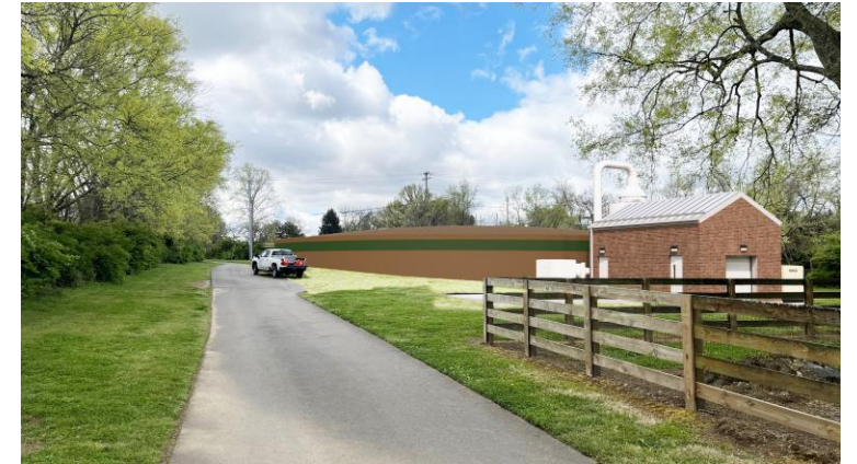
Deeper Bury Option – Sidewall 3 ft above grade on Concord Road side